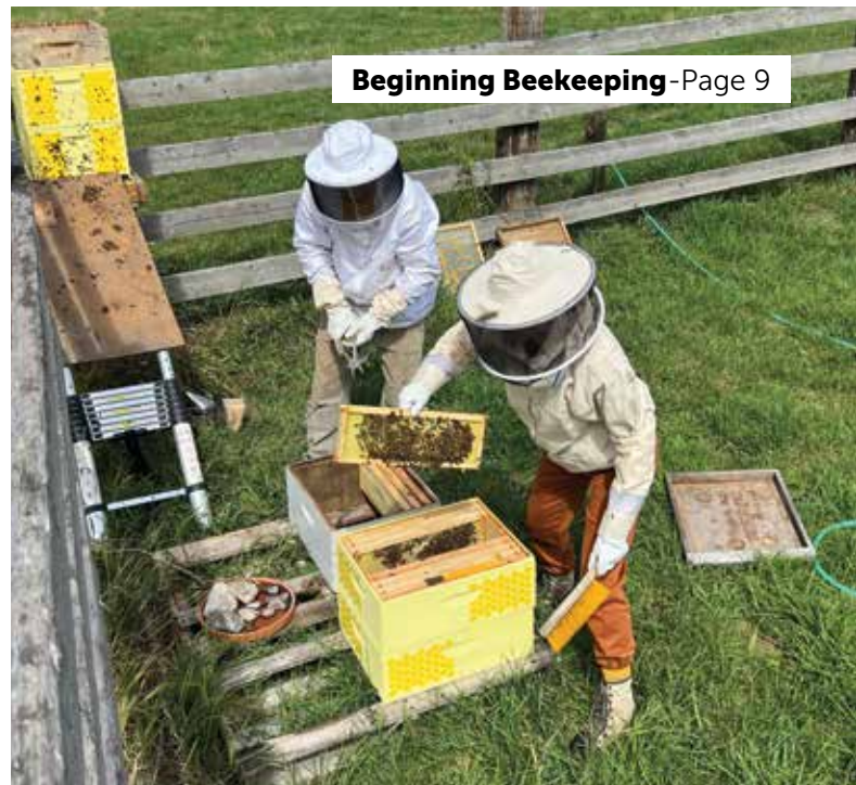
Beginning Beekeeping -Page 9