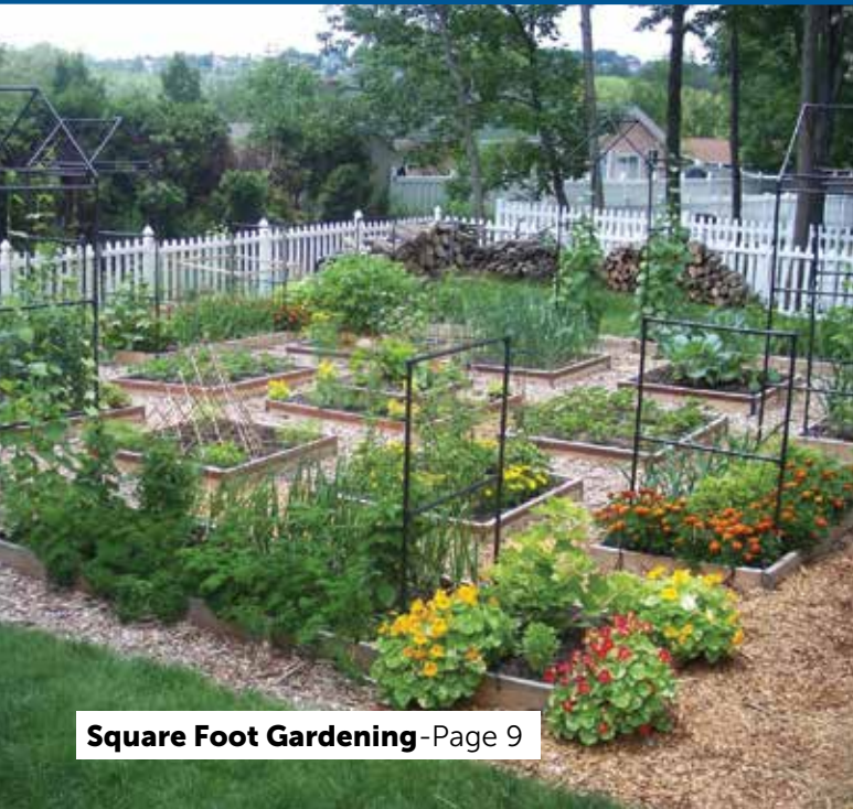
Square Foot Gardening -Page 9