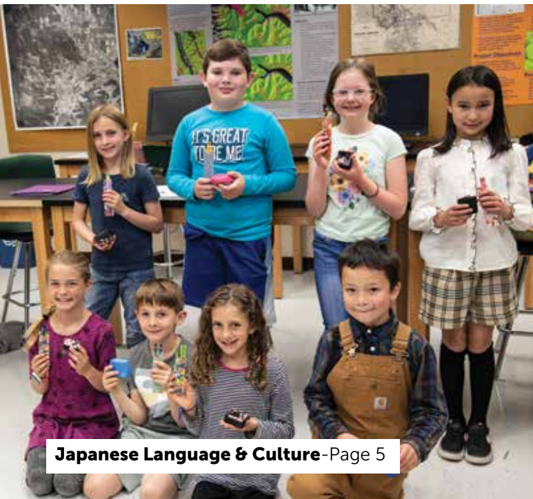
Japanese Language & Culture -Page 5