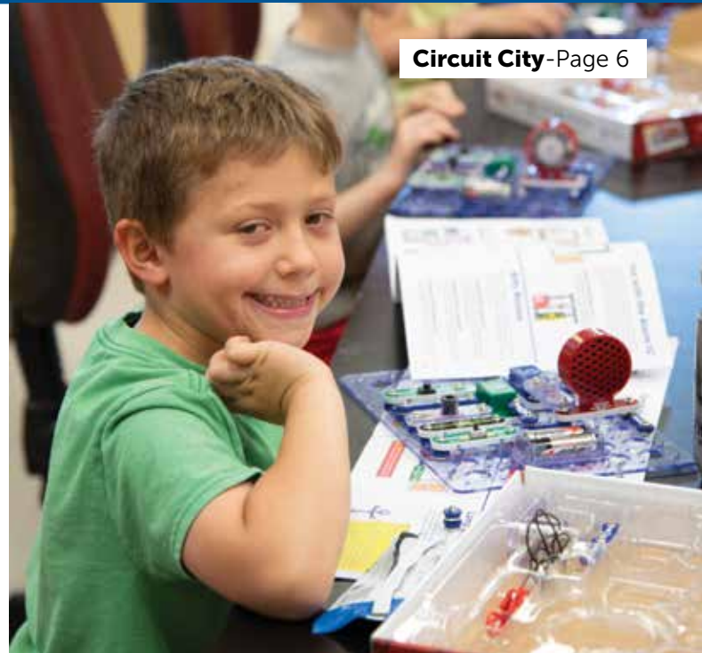
Circuit City -Page 6